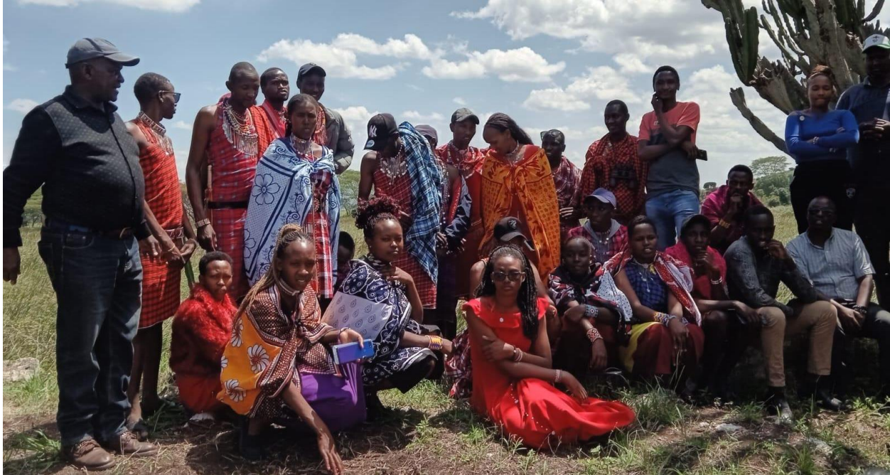
Pic 13: WTC Students' Educational Trip to Enarau

witnessed diverse strategies for preserving the environment, including combating degradation, protecting wildlife, and restoring degraded lands. They also gained an understanding of technology's role in monitoring biodiversity, soil health, and hydrological cycles.