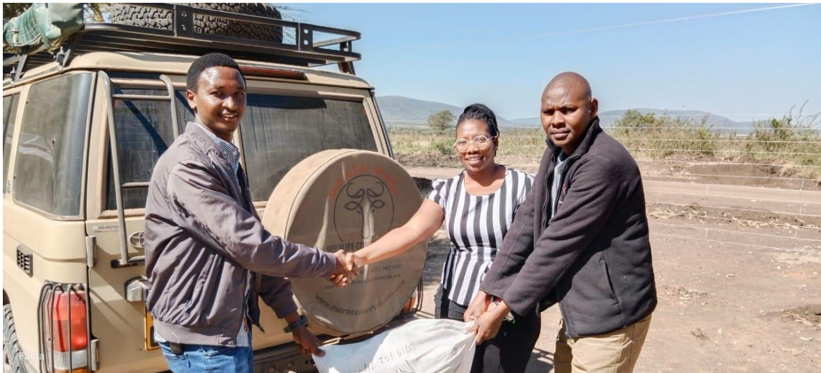
Pic 7: captures the Enarau Conservancy Manager receiving indigenous seeds from Maasai Mara Wildlife Conservancies Association.

Enarau Conservancy received certified indigenous tree seeds donated by MMWCA during the quarter. This has increased species diversity in the tree nursery, with new species such as Croton megalocarpus , Acacia abyssinica , Acacia Nilotica now being grown in the nursery.