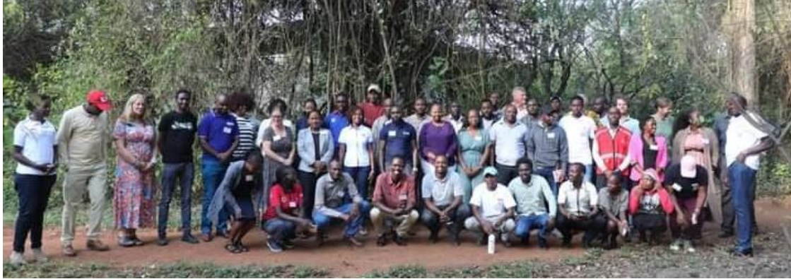
Pic 11: Government, NGOs, and conservancy teams after a WASH (Water, Sanitation & Health) symposium.