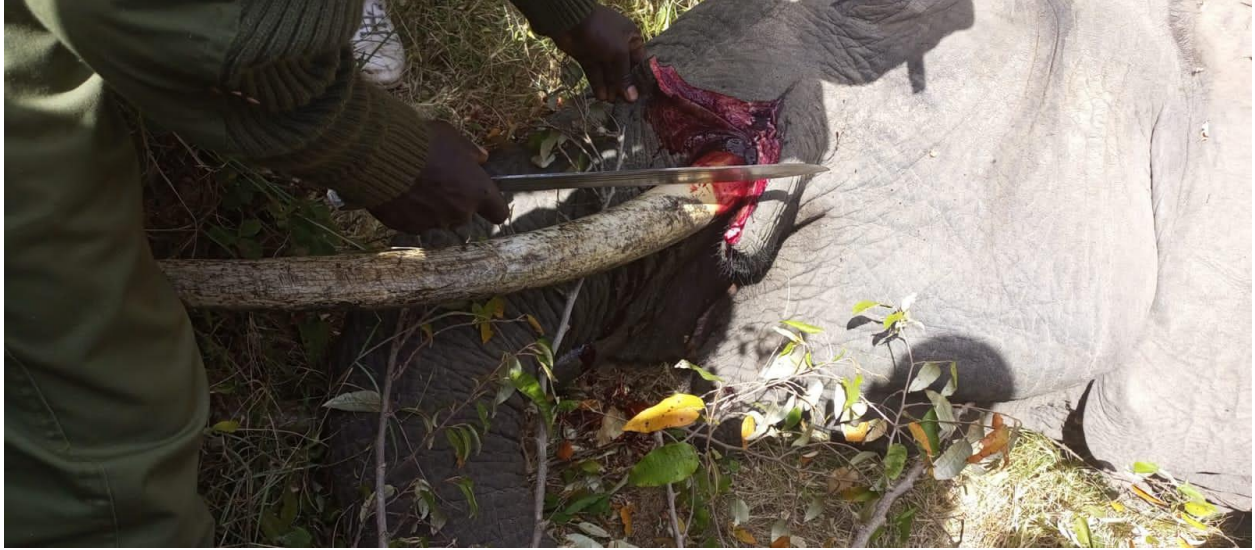
Pic 13: Elephant Eliminated Due to School Child Fatality