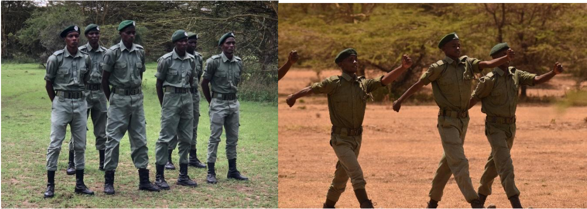
Pictures 1 and 2: Conservancy rangers in training and at the closing ceremony.

Enarau Conservancy is home to a prestigious habitat, protected by Enarau's rangers. In September, a team of six rangers completed an intensive refresher training program. This training equipped them with advanced skills in surveillance, wildlife management, and survival techniques, making them even more effective guardians of the environment. Following their training, the rangers were deployed to Kooruti station, where they assisted in restoring the Kooruti plain which is the most degraded part of the conservancy.