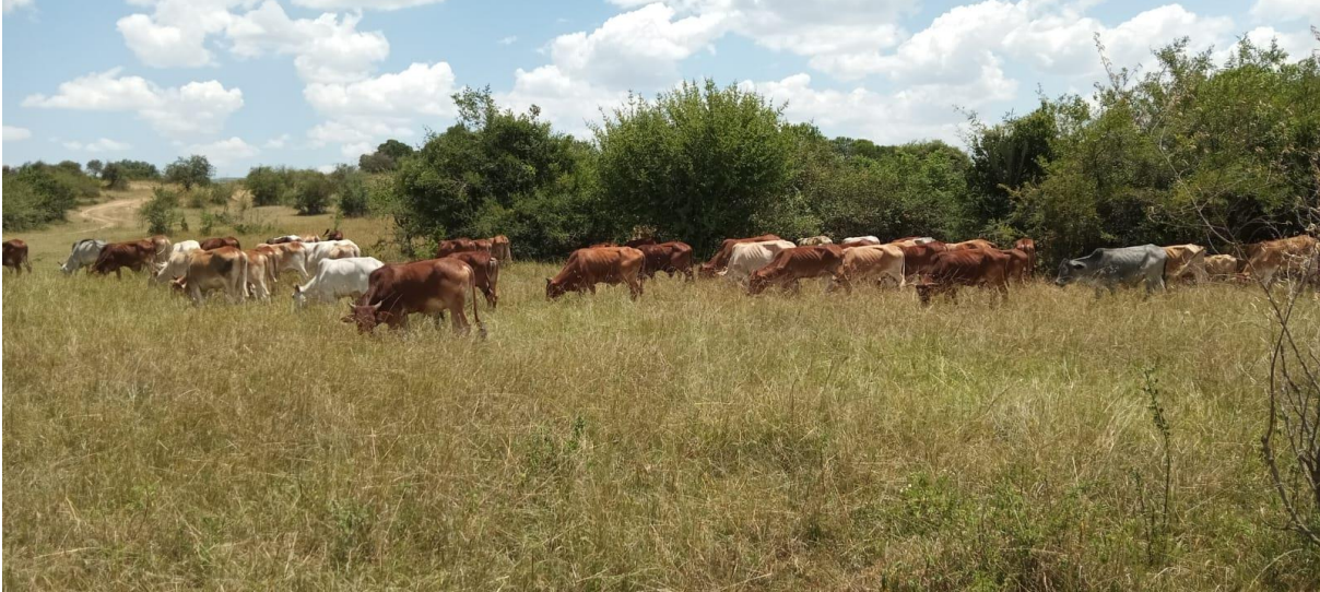
Fig 2: Shows the cattle grazing in the conservancy rotational grazing blocks, illustrating the practice of rotational grazing.

At Enarau Conservancy, we manage grazing across our four designated grazing blocks. During Q3, we observed that two of these blocks were occupied by livestock. Our Grazing Committee closely oversees these areas to ensure the well-being of both wildlife and livestock, keeping a close eye on sustainable practices and conservation efforts. This collaborative approach is a cornerstone of our commitment to maintaining a balanced ecosystem and supporting the local community.