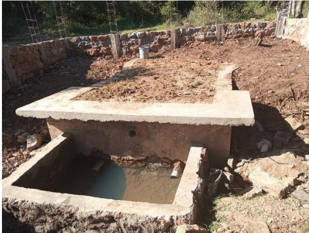
Pic 6: displays the Kipukeri spring rehabilitation conducted by MMWCA through the IMARA program, aimed at enhancing the conservancy's tree nursery

Currently, the Kipukeri spring rehabilitation project is underway. This aligns perfectly with one of our goals of producing more seedlings for onsite and external use thus enhancing our restoration efforts within and outside Enarau Conservancy.