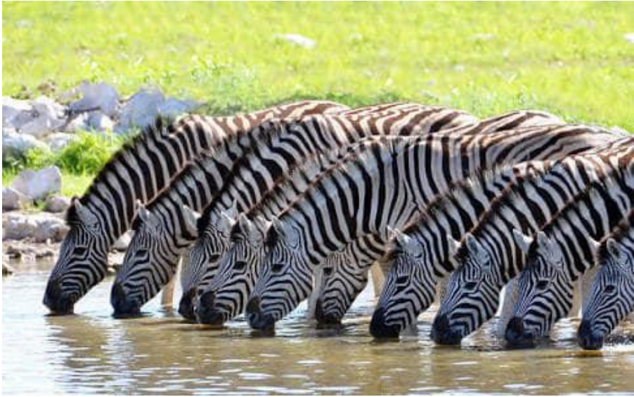
Pic 5: shows a water pan project implemented to provide water for both livestock and wildlife.

Through this project, we seek to mitigate the challenges posed by water scarcity during dry periods, thus promoting the coexistence of wildlife and livestock in harmony with the conservancy's delicate ecosystem. This initiative exemplifies our dedication to innovative solutions that benefit both the environment and the community.