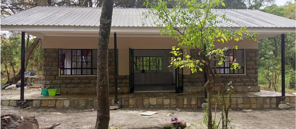
Pic 8: displays a newly finished research facility intended to provide accommodation for researchers

This research-based accommodation will serve as a central hub for researchers, fostering collaboration, and knowledge exchange. It will be a place where like-minded individuals deeply passionate about wildlife conservation can come together, share ideas, and work collectively to address the challenges facing our critical ecosystem..