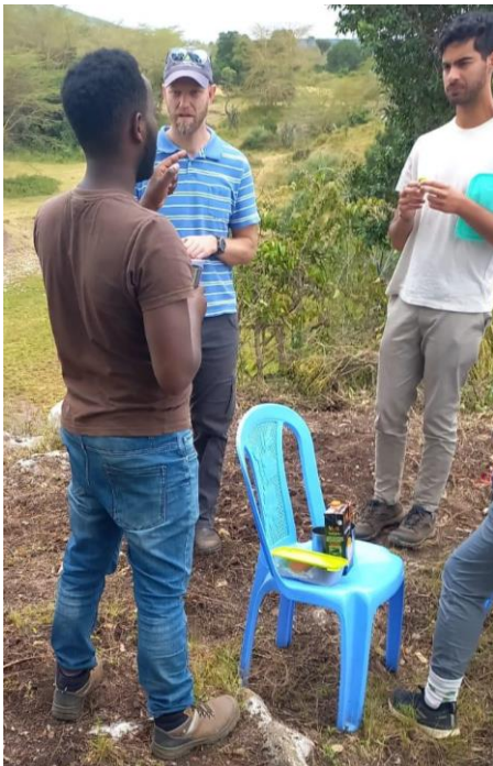
Pic 13: Smithsonian team Visit Enarau Conservancy for Informative Discussions and Collaborative Aspirations

During their visit, we engaged in informative discussions, sharing our insights and aspirations. It was an opportunity to align our efforts and explore how our collective expertise can contribute to the success of this crucial wildlife monitoring project. The visit further solidified our commitment to conserving and protecting our unique biodiversity, with the potential for valuable collaboration on the horizon.