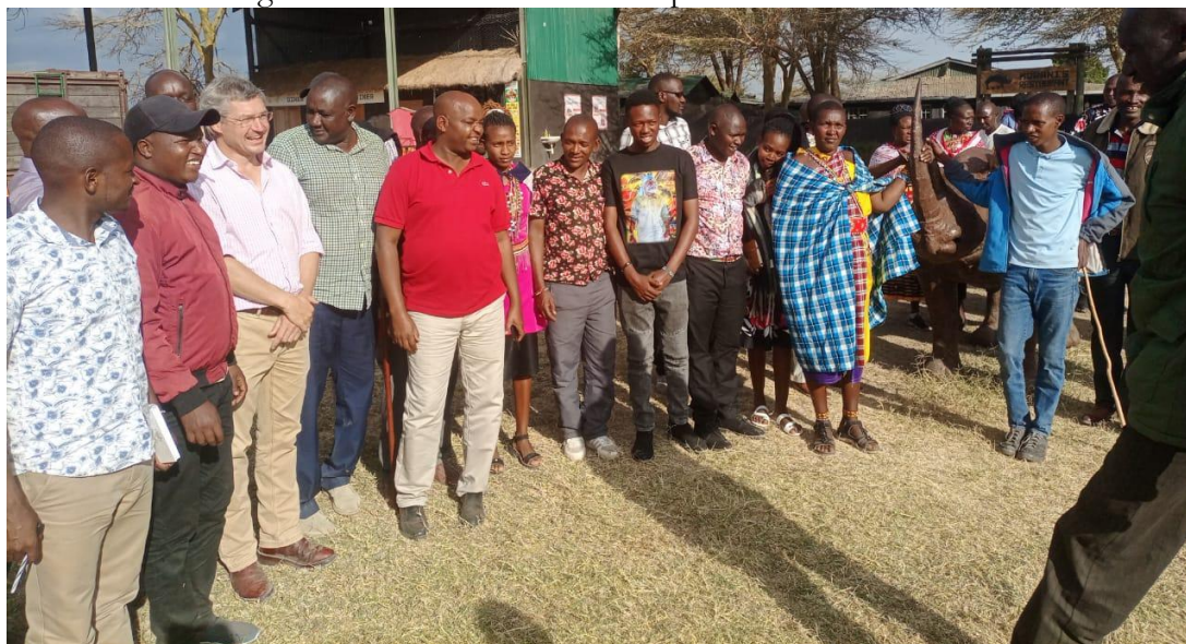
Pic 10: Mara Conservancies Board Members Benchmarking in the North

This was not just a trip; it was an opportunity to learn, connect, and grow together. Our Landowners Committee representatives are soaked in invaluable insights into how wildlife, livestock, and communities coexist harmoniously in these unique conservation areas. This educational journey has enriched our conservation approach and ignited new partnerships, emphasizing our commitment to continuous learning and innovative conservation practices.